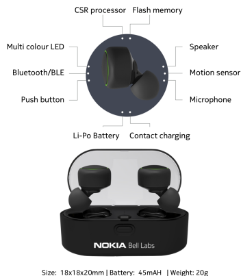
Figure 1: eSense open wearable platform with audio, motion, and proximity sensing.