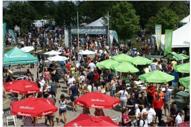
Figure 1. An example of crowd sensing scenario potentially full of opportunistic participatory activities (e.g. live video sharing and neighborhood gaming).

Copyright is held by the author/owner(s). SenSys '12 , November 6-9, 2012, Toronto, Canada. Copyright 2012 ACM 978-1-4503-1169-4/11/12