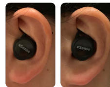
Figure 1: Example of wearing variability of an earbud

virtue of their fixed placement. Since they are mostly designed to be worn on a specific part of the body, e.g., a smartwatch on the wrist and a smart earbud on the ear, motion sensing on wearables can leverage the absolute orientation of the devices to monitor the fine-grained movement of a body part. For instance, a smartwatch can detect hand gestures including finger writing [12] and smoking events [6]. Dietary activities can be monitored by detecting the movement of an arm [7] and a jaw [1]. Even facial expressions such as laughing and frowning can be captured by monitoring the movement of facial muscles on an earbud [5].