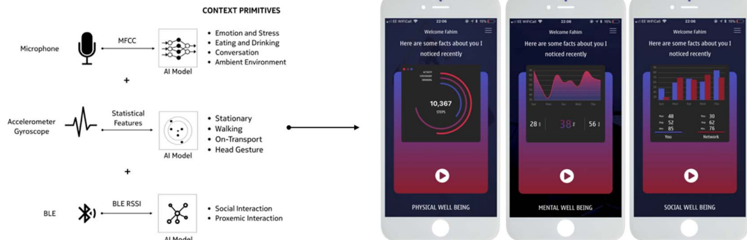
Figure 3. A personalized well-being feedback app for eSense that captures physical, mental, and social well-being at the workplace.

eSense can be effectively used to monitor head- and mouth-related behavioral activities including speaking, eating, drinking, shaking, and nodding, as well as a set of whole-body movements. It can also be extended to detect more minute head and neck movements to augment various clinical medicine applications related to neck and head injury. Moreover, with eSense conversational activity monitoring capabilities, social interactions can be quantified that to further help treat different mental health conditions and provide well-being feedback. Figure 3 shows a workplace well-being application that models eSense sensory streams for a variety of physical, digital, and social well-being metrics 10 and provides personalized and actionable feedback in conversational and visual representations.